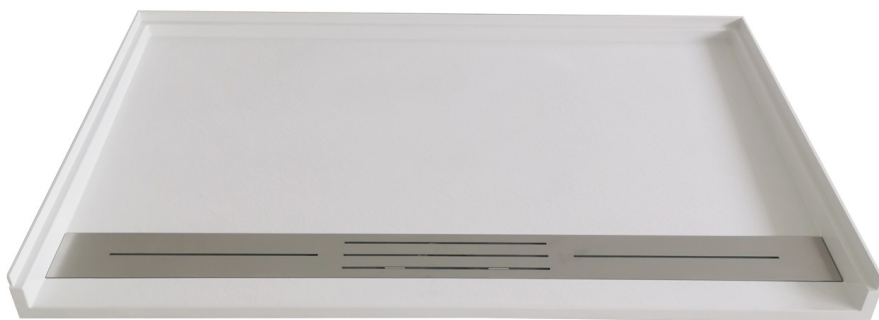
Shower Base View

This innovative NERVAL ADA shower base features high compression molded thermo set resin throughout, providing NERVAL CastStone ADA shower base with lightness and durability.